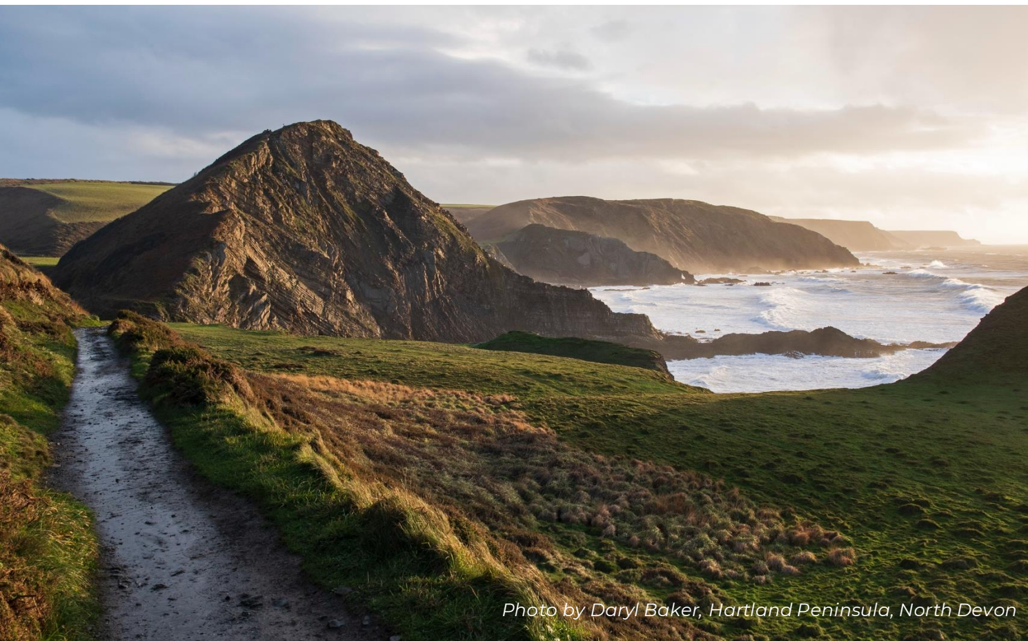
Hartland Peninsula, North Devon

We are the charity that has for over half a century been championing the South West Coast Path to make it one of the world's great trails.