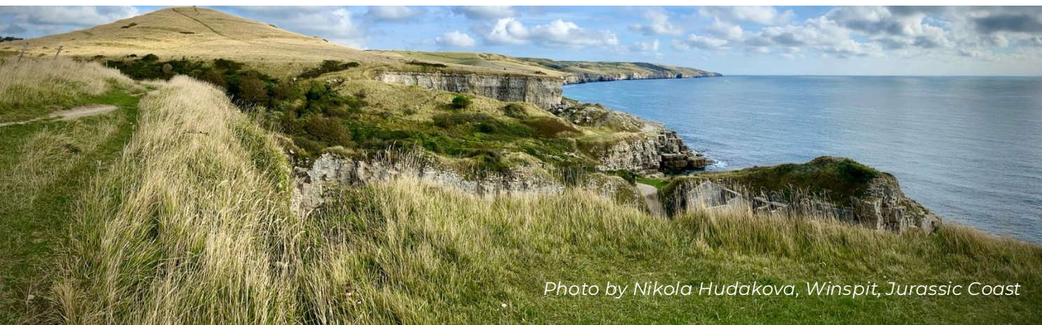
Winspit, Jurassic Coast

The SWCP is a precious wildlife corridor with over 70% in a National Park or National Landscape. Help us to protect it for future generations. Find out more HERE .