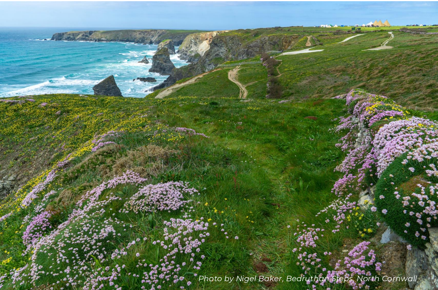
Bedruthan Steps, North Cornwall